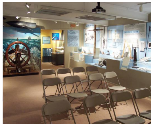
Our back gallery room